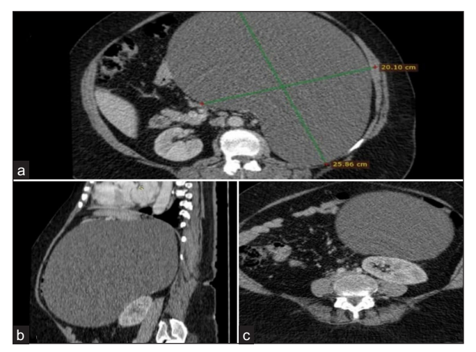
Figure 1 : CT-Scan Abdomen with IV-Contrast. Panel (a): Axial view of CT-Abdomen IV contrast showing huge left-sided cyst 25*20 cm with no solid component and septations with few areas of calcifications. Panel (b): Sagittal View of CT-Abdomen IV contrast showing huge cyst arising from left adrenal gland displacing pancreas superiorly and kidneys inferiorly. Panel (c): Axial view of CT-Abdomen showing cyst compressing the left kidney.

Cystic fluid was found negative for malignant cells. Histological examinations of sections revealed adrenal gland parenchyma showing a cystic cavity containing hemorrhagic material and hemosiderin-laden macrophages in the lumen.