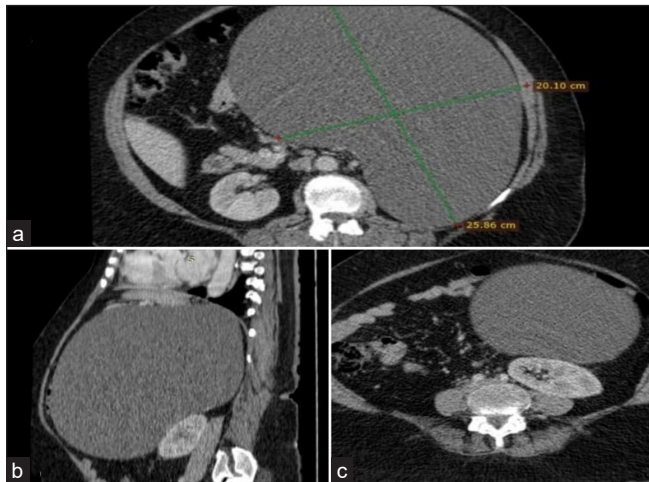
Figure 1: CT-Scan Abdomen with IV-Contrast. Panel (a) Axial view of CT-Abdomen IV contrast showing huge left-sided cyst 25*20 cm with no solid component and septations with few areas of calcifications. Panel (b) Sagittal View of CT-Abdomen IV contrast showing huge cyst arising from left adrenal gland displacing pancreas superiorly and kidneys inferiorly. Panel (c) Axial view of CT-Abdomen showing cyst compressing the left kidney.

Cystic fluid was found negative for malignant cells. Histological examinations of sections revealed adrenal gland parenchyma showing a cystic cavity containing hemorrhagic material and hemosiderin-laden macrophages in the lumen.